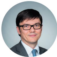
Andriy Pyvovarsky, Minister of Infrastructure, age 37