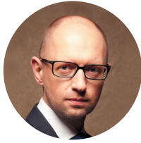
Arseniy Yatsenyuk, Prime Minister, age 41