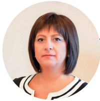
Natalie Jaresko, Minister of Finance, age 50