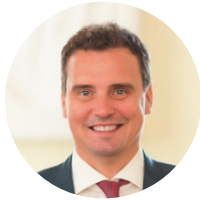
Aivaras Abromavicius, Minister of Economic Development and Trade, age 39