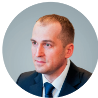
Oleksiy Pavlenko, Minister of Agrarian Policy and Food, age 38